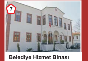
Belediye Hizmet Binası