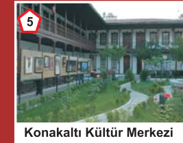
Konakaltı Kültür Merkezi